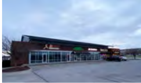
1777 N. 86th Street For Lease $13.00/SF NNN 2,415 SF Sally DeLair/Jared Froehlich Link to MRCIE #30717961