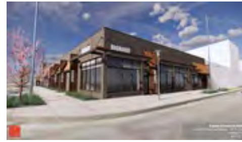
1745 'O' Street For Lease $14.00/SF NNN 1,256-4,788 SF Marc Hausmann/Sally DeLair Link to MRCIE #30514144