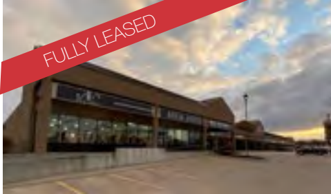
Meridian Park Retail 6900 'O' Street