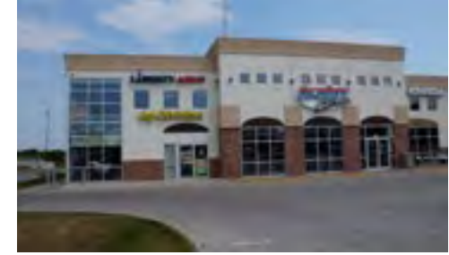
6600 N. 27th Street For Lease $12.00/SF NNN 4,300 SF Marc Hausmann Link to MRCIE #30166444